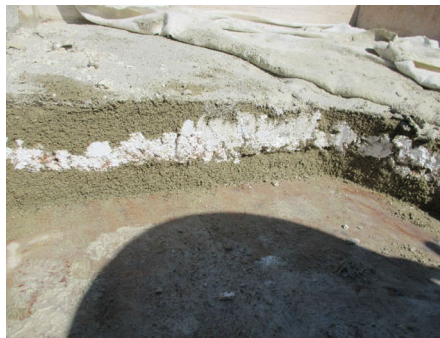
(e) The mortar is prepared with the cooled, slaked lime. When preparing the mortar, the masons shovel across the pile to pick up all the layers.