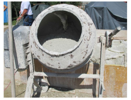
(f) Finally, standard mixing is carried out in a paddle or drum mixer, and water is added to achieve the desired consistency.

was very durable and could be used even against seawater erosion’.