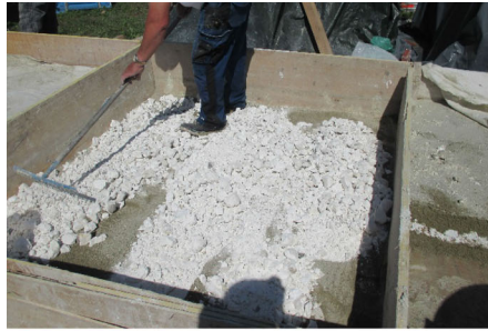
(a) Half of the sand is spread on the ground and covered with crushed quicklime. The volume ratio of quicklime to sand is 1:7-9.