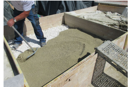
(b) The layer of quicklime is then covered with a second layer of sand.