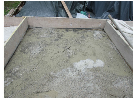
(d) The assemblage slakes for three or four days covered with fabric.