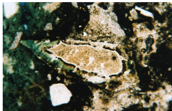
Fig. 2 Alkali silica reaction in chert aggregate. The wide reaction rim indicates strong reactivity that could have been enhanced by heat. Jiggistown House. Natural light 10X

Therefore, particles of un-slaked and over/under-burnt or unslaked lime can appear in hot-lime mixed mortars as well as in any other traditional mortars. Consequently, they can hardly represent evidence of hot-lime mixing alone. However, there are microscopic features such as the widespread presence of strong, alkali-silica reaction (Fig. 2) that indicate high reactivity, and hence can indicate hot-lime mixing. Pavia [31] states that the presence of widespread reaction rims in sand grains due to alkali-silica