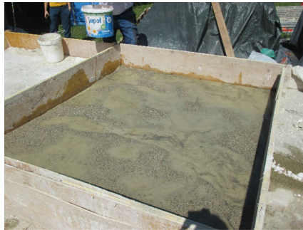
(c) Water is sprinkled to initiate slaking.