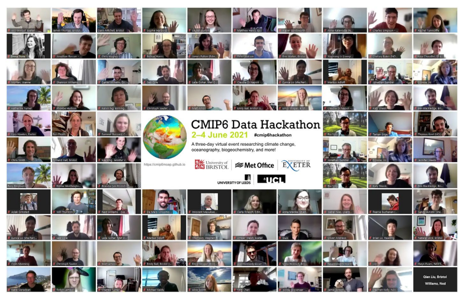
Figure 1. Group photo of the CMIP6 Data Hackathon Participants that took place virtually from 2 to 4 June 2021.