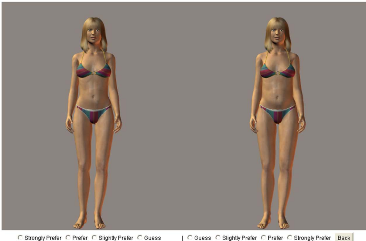
Figure 1. Example frame from the body size preference task. doi:10.1371/journal.pone.0048691.g001

Please indicate which body you prefer and how much you prefer it, by clicking on the line below.