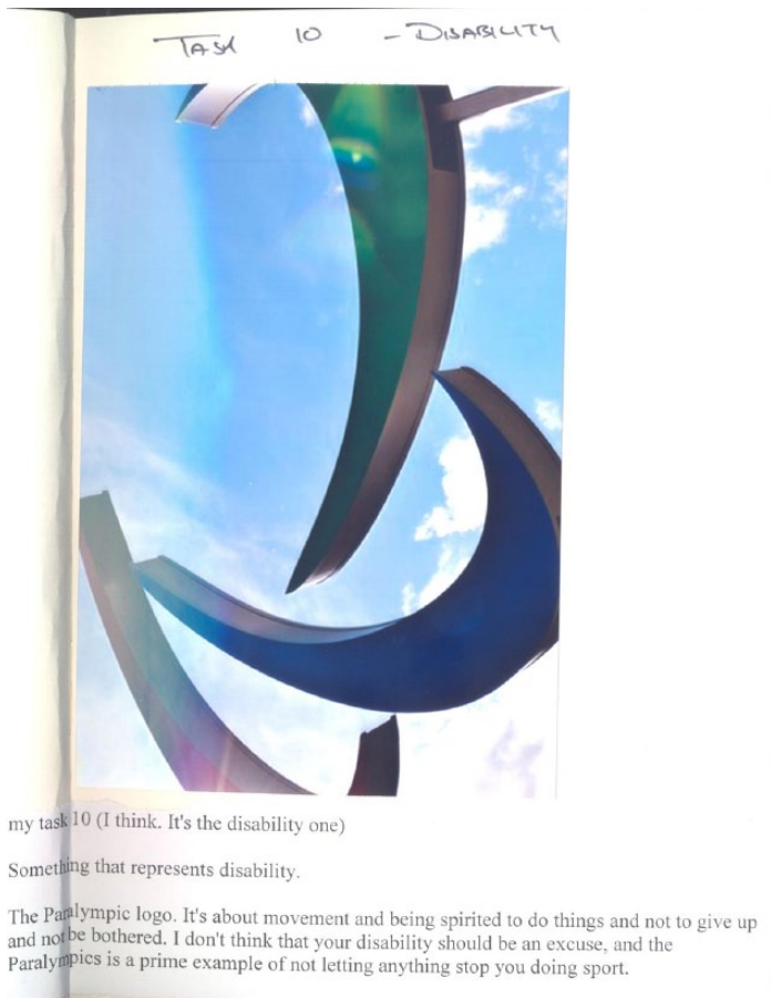
Figure 7. Kate, photo journal. Text reads: 'It's about movement and being spirited to do things and not to give up and not be bothered. I don't think that your disability is an excuse and the Paralympics is a prime example of not letting anything stop you do sport'.

addition, their shared aim was to challenge a prevalent representation of disability: that of the passive, dependent figure. Within their visual accounts of the active subject, their narratives varied, indicating there are different ways to frame and enact what being such a subject involves. What we want to do here is discuss two different active subjects that emerged in the accounts of Kate (15) and Mark (17): 1) the attractive female teenager, 2) the aggressive disabled sportsman. In doing so what we want to do, as well as capture their vivid accounts of their active and valued lives, is to explore the importance of existing visual representations and associated social values in how they did so.