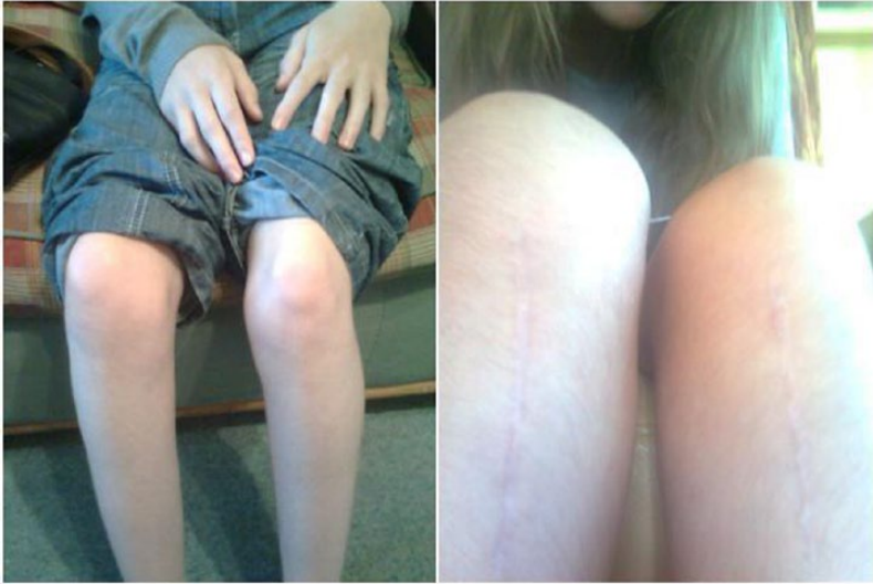
Figure 3. Kate's legs before and after surgery, included in her photo journal.