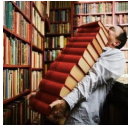
Figure 1: Image used for the Picture condition

The study was designed and hosted on Qualtrics 2 , accessible via a personalised link. The study consisted of a welcome message outlining the exclusion criteria and instructions, as well as a mandatory tick box for consenting to take part in the study. The following page randomly presented the participant with one of the 8 conditions for creating a password. Then, participants were taken to a demographics questionnaire where they were asked to fill standard information such as country of residence, year of birth, gender, and education details. Finally, participants were asked to re-enter the password they created during the first step. The time spent on each page, as well as the number of clicks and the timing of the clicks was recorded by the platform.