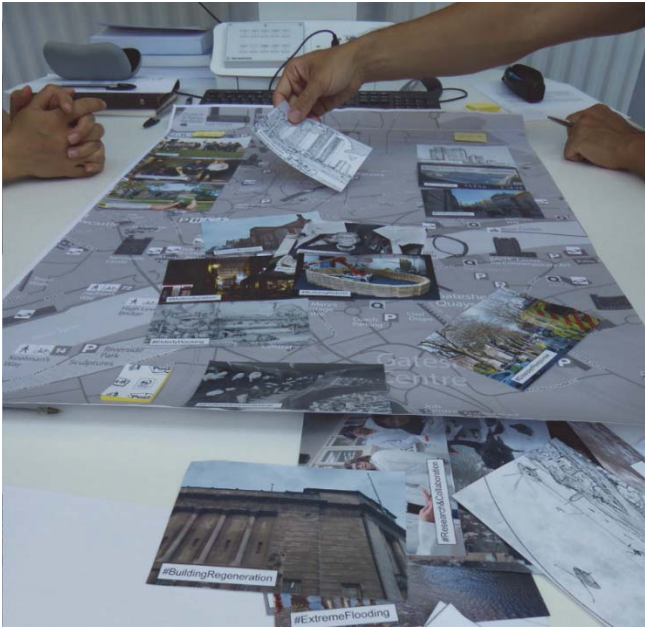
Fig. 2. Cards and map of public space in Newcastle upon Tyne (UK), in process for the second envisioning experiment of collective ‘card sorting’