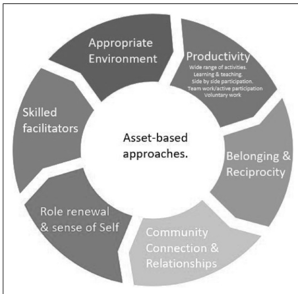
Figure 1. Factors which improve older men's engagement in community social participation activities.

In summary, social participation activities are shown to alleviate SIL. While there are numerous community offerings, many are feminized which may leave older men marginalized within the landscape of care. Although there are male-specific interventions, such as Men's Shed, this initiative may not resonate with all men's interests or manifestations of masculinity. What is known is that an asset-based approach as shown