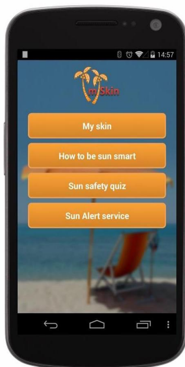
Figure 1. Main screen of the mISkin app.

This involved a gamification component, by which participants received performance-based rewards (ie, positive feedback and a final score message), with immediate feedback on general recommendations for sun protection. Fourth, the Sun alert service menu allowed participants to receive sun protection reminders. The default setting for this feature comprised a minimum of two prompts, but participants could customize these to suit their preferences (eg, times and frequency). This menu also included a self-monitoring feature that recorded sun protection from 11 AM to 3 PM.