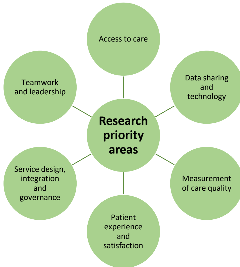
Figure 2: Six conceptual topics that are research priorities for integrated care and cross-boundary working.