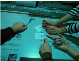
Figure 2. Mobile technologies and downward projection as used in-class.