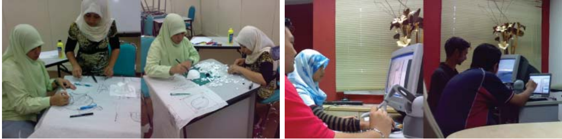
Figure 2: Prepared traditional (left) and 3D sketching (right) design settings.

data collection was the Studio Master of the course. The conducted case study identified the characteristics of current design media and collaborative design culture of conceptual architectural design process. Consequently, the recommendations of the case study research helped us to develop theoretical foundations of the study.