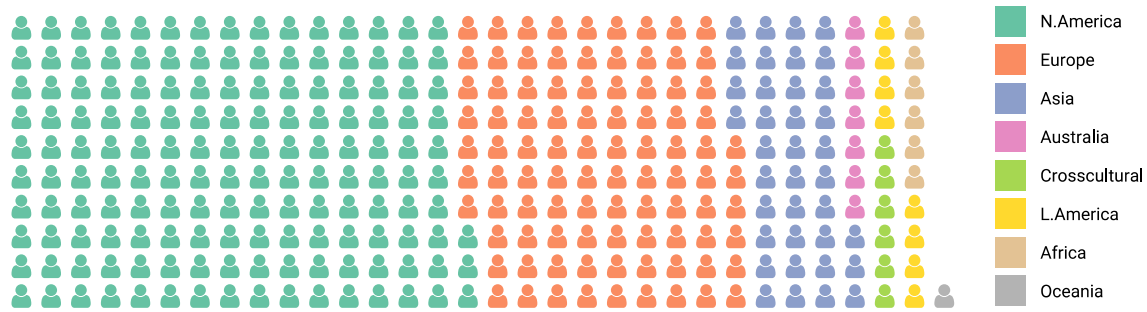
Fig. 1 Origin of samples. N. America, North America; L. America, Latin America and Caribbean