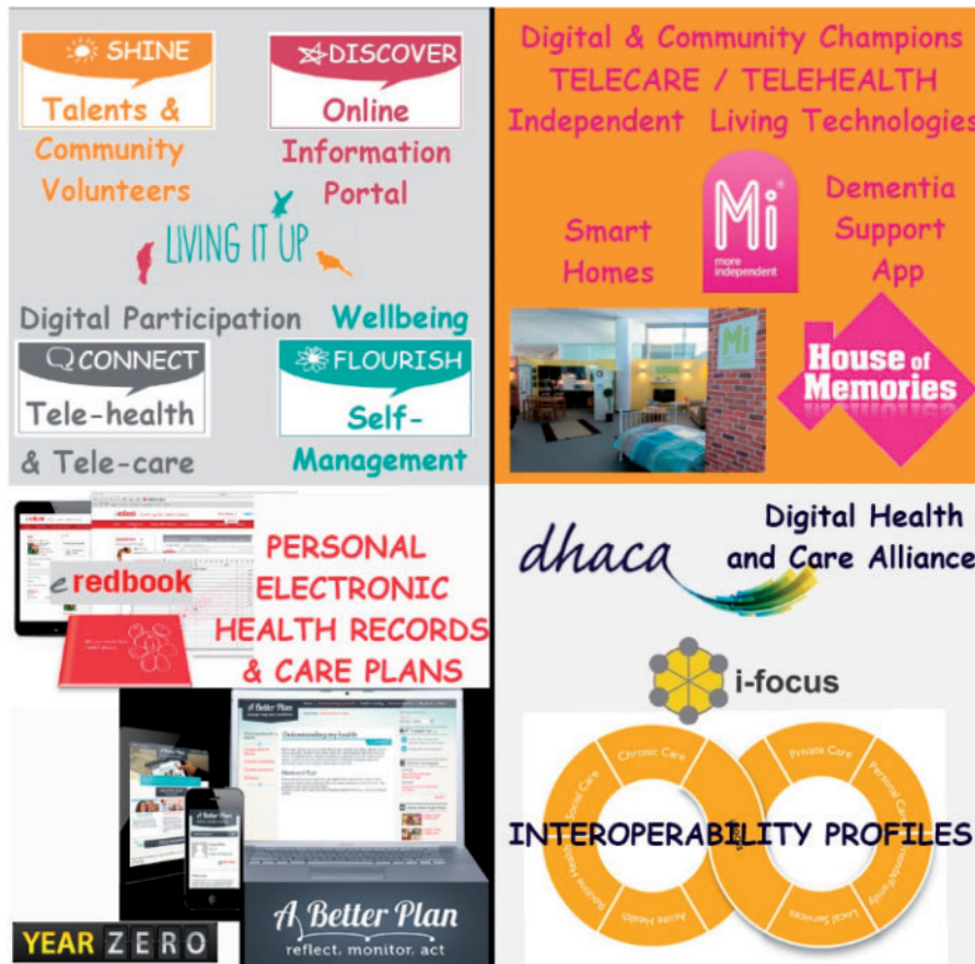
Figure 1: The 4 multi-agency dallas consortia.

University of Glasgow ethical approval was granted for this study. All respondents provided consent for participation. Identities are protected