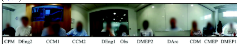
Figure 2. Extract 2 (Meeting 4): Constructor using stereotype of constructors to create humour. Adapted from Based on Sacks et al. (1974).

DEng1 : obviously the handrail isn't going to be there? ((smiles, points at television)) DArc : yeah no no no no no {ha ha ha ((shakes head/smiles))} DEng1 : {ha ha ha ha ha ha} DEng2 : {ha ha ha ha ha ha} CCM1 : ((smiles/turns head to television)) CDM : {ha, ha, ha I like it ((smiles)) ha ha ha} DArc : fine CDM : we will build it like that mind ((smiles, turns head to DArc)) {ha ha ha ha} DEng1 : {ha ha ha ha} CCM1 : {ha ha ha ha}