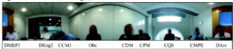
Figure 1. Extract 1 (Meeting 1): Banter connected to task-related conversation. Adapted from Based on Sacks et al. (1974). AQ12

The use of banter involving the constructors demonstrates a level of comfortable informality and, interestingly, the presence of familiarity during the first and subsequent meetings appears to create a positive, comfortable working environment throughout for the group. Extract 1 – Meeting 1 (see Figure 1) is taken from the first meeting and demonstrates the group’s use of humour through banter.