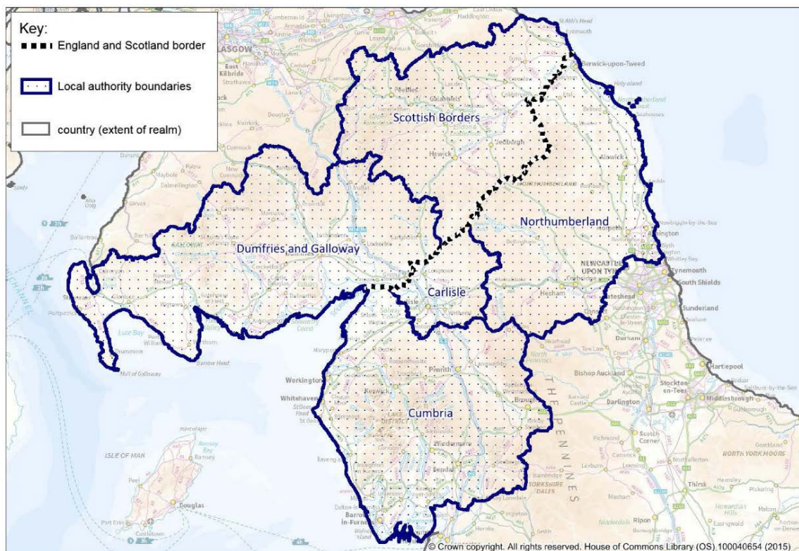
Figure 1: The Borderland's Deal Local Authorities