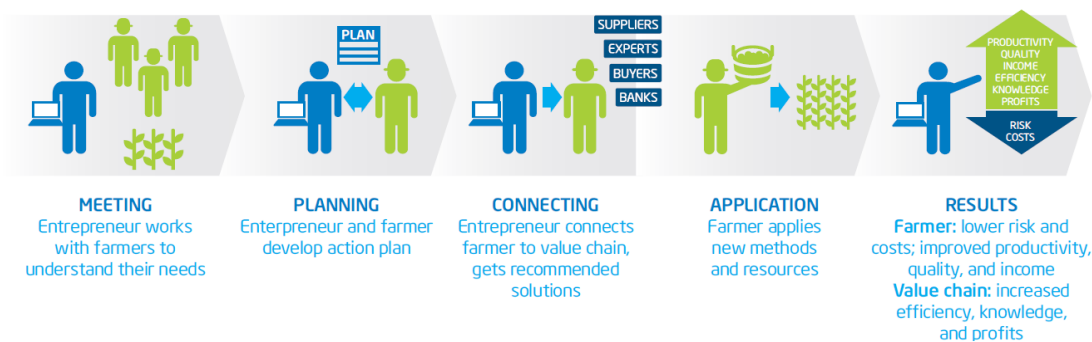
Adopted from Intel (2012)