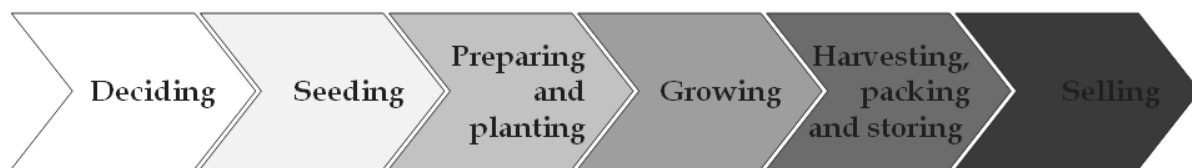
Figure 1: Agricultural Value Chain

Adopted from De Silva & Ratnadiwakara (2008; p10)