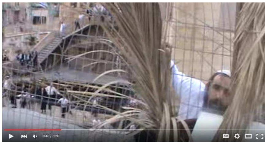
fig.3 still from video 'Hebron - Settler attempts to take down Palestinian flag, 2014' [ https://www.youtube.com/watch?v=a1s3Qt-Tm5I ]