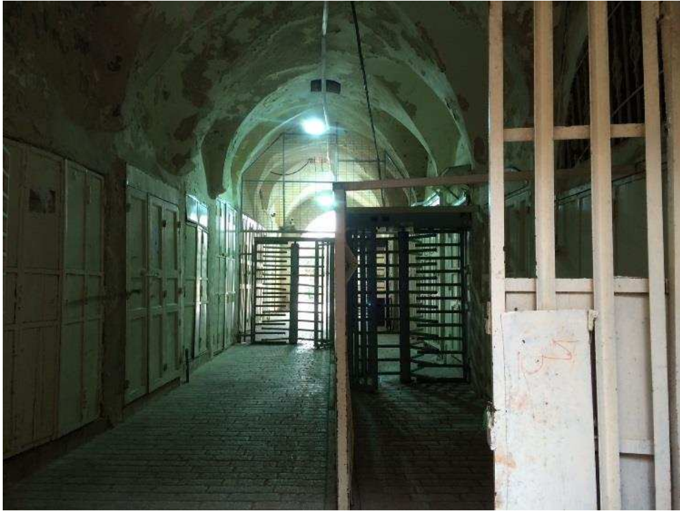
fig.2 checkpoint between the market and the Ibrahimi Mosque