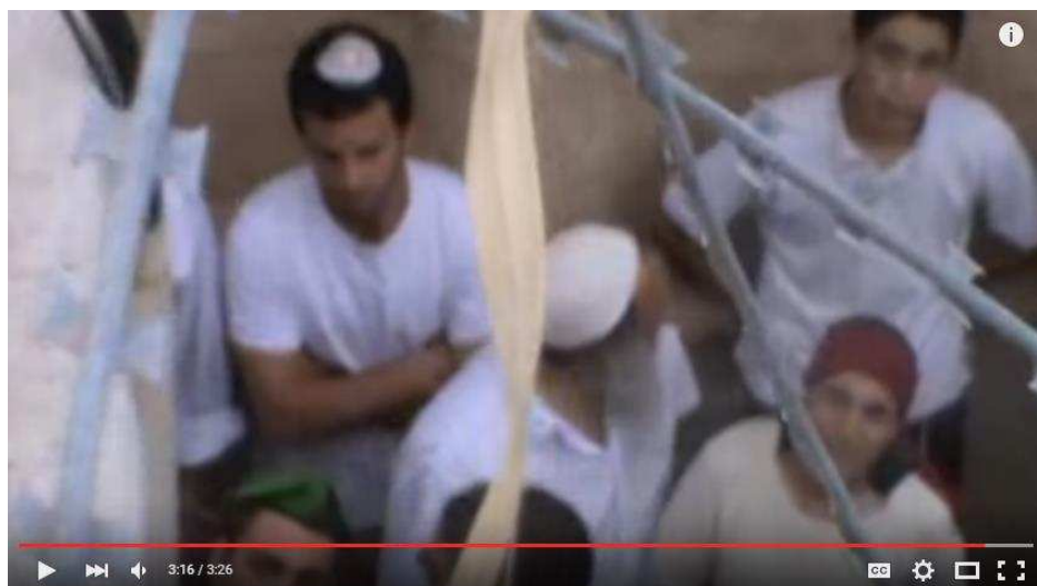
fig.4 second still from video 'Hebron - Settler attempts to take down Palestinian flag, 2014'