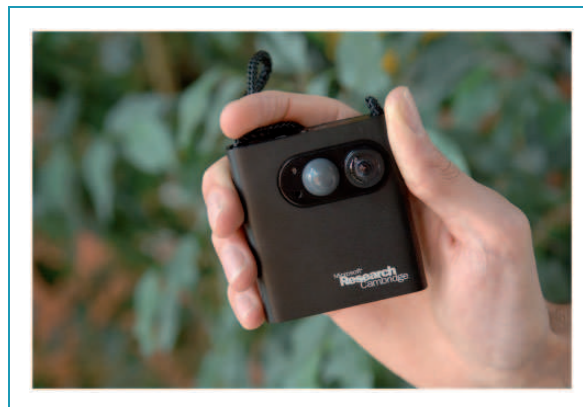
Figure 1. The Sensecam.

The Sensecam is a small, light (93 g) camera and is worn on a lanyard around the neck, resting on the user's chest. The Sensecam comprises a camera (640 × 480 pixels) with a fish-eye lens to provide a horizontal 130-degree field of view. 32 The Sensecam automatically captures at least one image every 30 seconds (Figures 2 and 3).