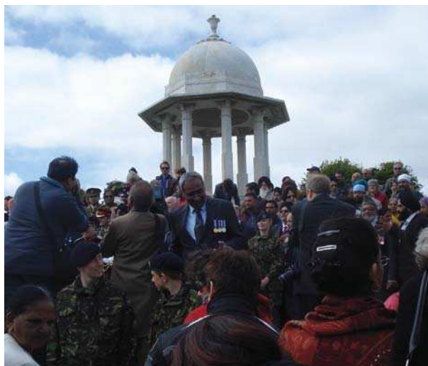
Figure 5. Participants converge on the steps of the memorial for a final group photo, June 2013.

emotional memories of historical experiences particular to India, not necessarily connected to the Chattri, which they perceived as a time of unity and belonging within their community: