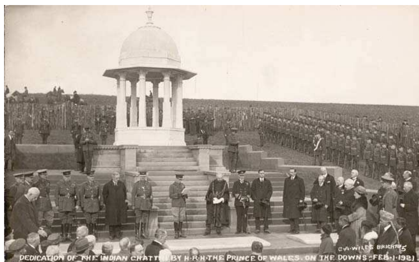
Figure 2. Chattri Memorial dedication ceremony, Brighton, 1921.

This memorial’s original valuation was thus based on its function as an imperial gesture in the wake of World War I. However the maintenance of historical value depends on continued enactments of rituals of remembrance. Instead, the Chattri was abandoned by the government after its unveiling,