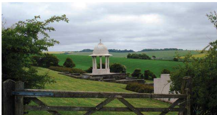
Figure 1. Chattri Indian Memorial site north of Brighton on the Sussex Downs.