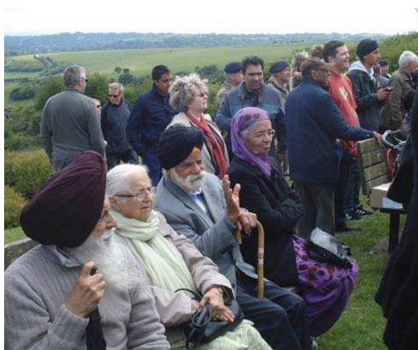
Figure 4. Participants assemble before the Chattri Memorial ceremony, June 2013.

What's really nice is no matter what's the weather, you'll still have a good turnout.... people still trek up there in their wellies or whatever, in their raincoats and wellies.... If I miss it, I feel quite guilty that I have missed it. I think that the first time I went, I went because my mom goes and I have to go and support this. Now it's something I take my children to. (Interview M, March 26, 2014)