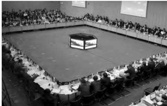
Figure 1: FATF Plenary in session February, 2012