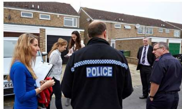
Fenland district council officers, police and fire fighters carry out house inspections in Wisbech.