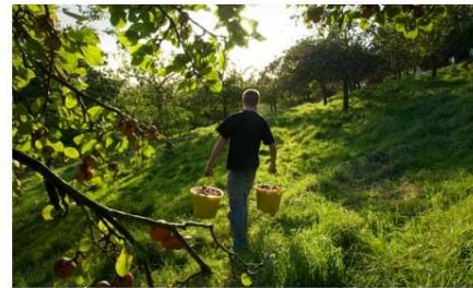
Gheorge Ionas paid migrant workers less than the minimum wage to pick apples for a farmer with several orchards (not pictured).