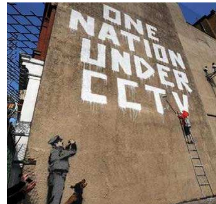
Synopticon (by the public looking in on nurses) Observation of the few by the many