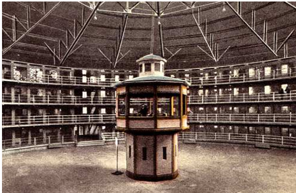
Panopticon (within the profession) Observation of the many by the few

Normalisation (Rose 1999): Through shame we conform to Neo-Liberalism goals. Shame entails an anxiety over external behaviour and appearance of self leading to Self-Surveillance.