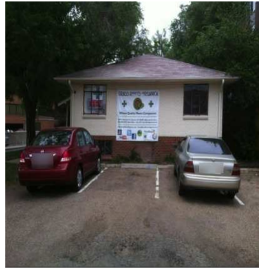
Figure 1. Typical Medical Marijuana Centers in Denver, Colorado (2010).