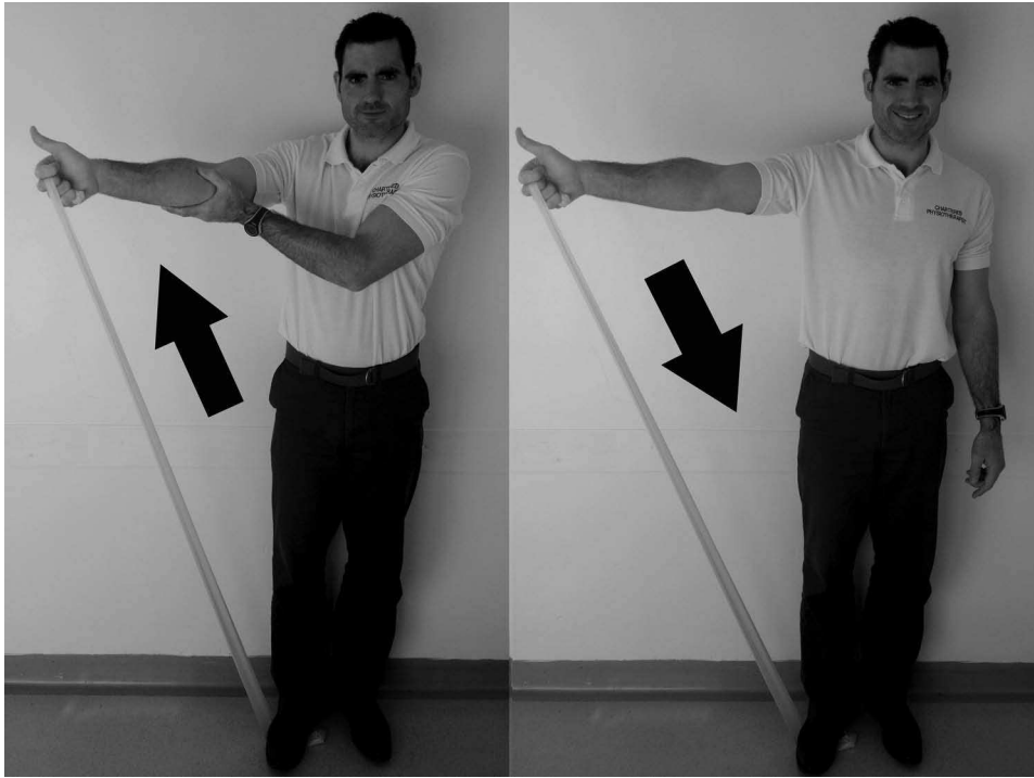
Figure 2. A demonstration of the eccentric exercise technique.

Patients were invited to telephone the lead researcher (M.B.) if they experienced any problems although none actually did. Patients in exercise groups had a review appointment with the lead researcher (M.B.) in the Physiotherapy Clinic 4 weeks after commencing the trial. It was felt that reviewing patients in the clinic more frequently than once every 4 weeks might have a negative effect on compliance if they had to arrange appointments around work or had to travel a long distance. At the 4-week appointment, the amount of resistance used for the exercise groups was increased as a treatment progression provided there had been no deterioration in symptoms. This was done by giving the patient the next grade of resistance of elastic exercise band (coloured red).