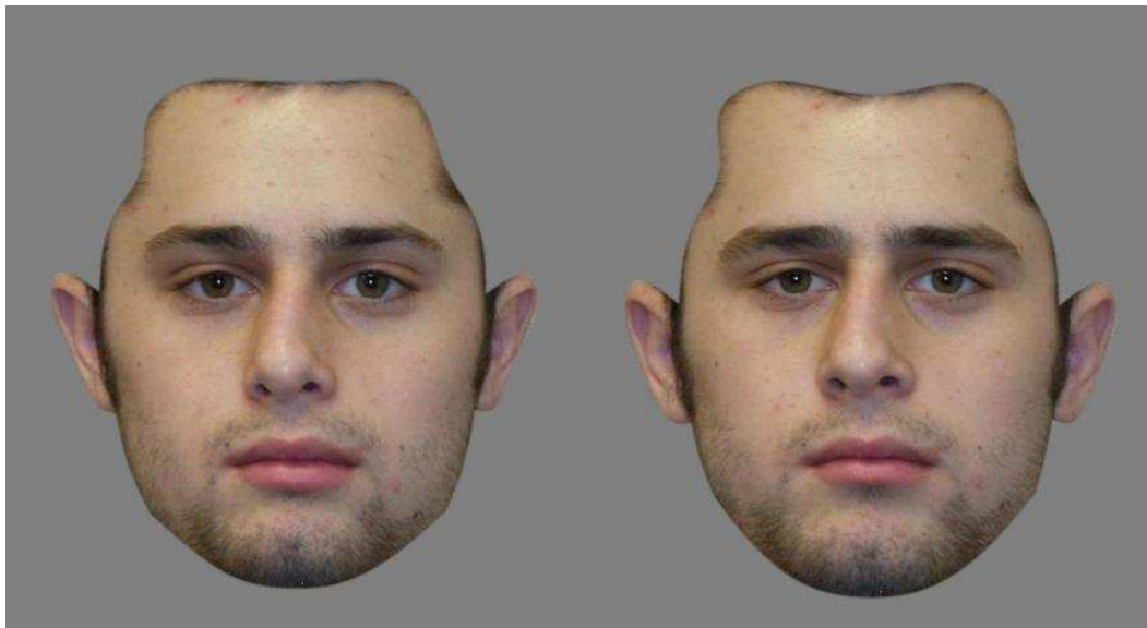
Figure 1. Example of a feminized (left) and masculinized (right) male face.

each image by \pm 50\% of the shape differences between symmetrical male and female prototypes using standard computer graphics methods (e.g. DeBruine, et al., 2006; Little, et al., 2001; Welling et al., 2008). Prototypes were made by averaging the face shape of 60 White undergraduate aged men/women, who were photographed with a neutral expression and without glasses or facial jewelry. For convenience, +50\% transforms will hereafter be labeled masculinized, and -50\% transforms, feminized. This type of transformation produces photorealistic images that independent raters perceive as differing in masculinity (DeBruine, et al., 2006; Welling, et al., 2007). We obscured hair, neck, and clothing with a mid-gray solid mask (see Figure 1), because studies show that non-face information can affect facial masculinity preferences (DeBruine, Jones, Smith, and Little, 2010; Wen and Zuo, 2012).