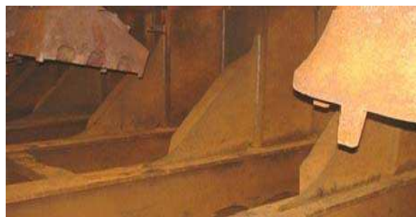
Fig. 1 Marine coating degradation showing rust in water ballast tanks [16]

Before 1880, solid ballast media such as stone, sand and rock were used [15]. These media were bulky and very difficult to handle especially during voyages in extreme sea conditions and resulted in long delays while ballasting or de-ballasting was carried out. These challenges drove the need for an alternative ballast medium and from the 1880s to the present day seawater became the preferred medium [15]. However, this medium came with the challenge of corrosion that ultimately led to the need for WBT coatings.