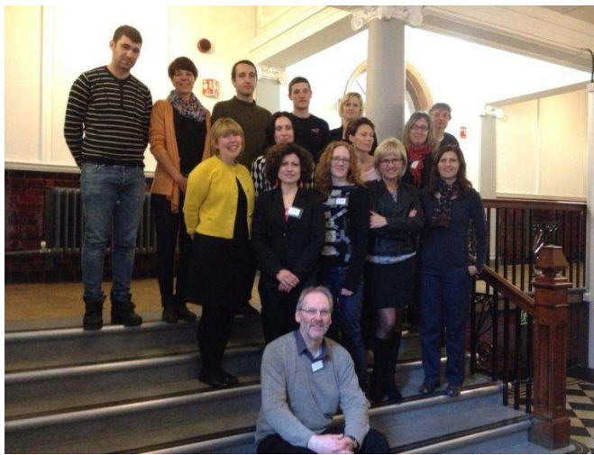
Figure 2: The team and workshop participants, Staffordshire University, March 18 2014.

In the first phase of the project partner teachers from schools in Croatia, Denmark, Poland, Sweden and the UK came together in Stoke-on-Trent for a three-day workshop hosted by Staffordshire University on March 17–19. The team met to discuss how teachers can work with their pupils and students to discover a love for literature