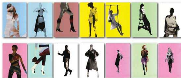
Fig. 1. Pictures used in the study

Fourteen pictures (Fig. 1) were hung in the gallery, on the locations presented in Fig. 2. All participants saw the same pictures, but the sequence (i.e. placement at the specific location) was randomised for each person. Knowing what was the location of each picture in the gallery for the given participant allowed gaze movement and the subsequent memory test results to be coded in two ways, separately: as location-oriented variables (Which locations attracted more fixations; which locations ’ content was memorised better?), and as picture-oriented variables (Which of the pictures generated more fixations; which pictures were memorised better?).