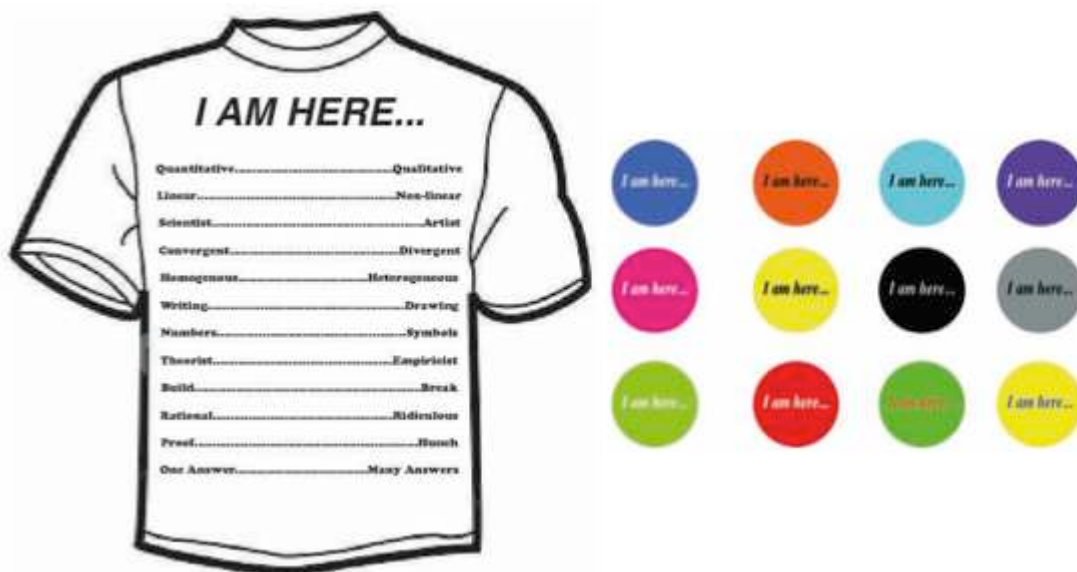
Figure 1. T-Shirt Exercise Tools (T-Shirt and Coloured Badges)

The project's first workshop involved a number of creative activities, which aimed to examine the disciplinary perspectives of each participant that would, in turn, allow comparisons to be drawn between them. The selection of creative activities was carried out after a review of workshop techniques from the experiences of network members and action research techniques. The first exercise involved each participant wearing an identical T-shirt with a series of conceptual linear spectrums printed on it such as "Scientist.....Artist", "Build.....Break", and "Proof.....Hunch" (Figure 1 - left). Each participant was asked to pin a badge labelled "I am here..." (Figure 1 - right) where they felt they belonged on every spectrum.