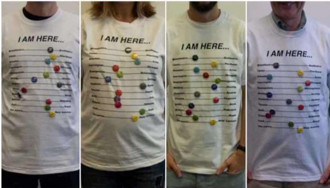
Figure 2. T-Shirt Exercise (participants' completed versions)

The next exercise, “The Future Interdisciplinary Character”, challenged the participants to think about the future, complex, inter-connected world we are set to inhabit and to think about what skills, knowledge and experiences will be needed to best address these issues. Here, each participant was given a “blank character” (Figure 3 - left) and asked to complete it so that it fully described the “The Future Interdisciplinary Character” who might be best positioned to address the world’s future challenges.