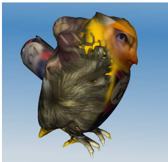
Figure 2. Harold's 'Owl'. Copyright the artist © .

Some participants produced work which they found compelling. Harold for example took a preset owl from 123D Sculpt, stretched the digital clay from its back and superimposed a photograph of a can of lager. He also used the brush tool to add a photograph of another workshop participant's eye (Figure 2). In the life drawing session he photographed the model's testicles and 'painted' these over the 123D Sculpt preset head. During the vehicle drawing session out on location he superimposed the Bentley car badge onto the forehead of a photo of Charles. Both Harold and the other artists felt that these works were in themselves engaging. Later on, Harold mentioned he imagined 3D prints of his lager-owl selling as 'limited editions' for thousands of pounds each, arguing that if prices were not high then the work would not be taken seriously.