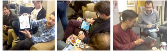
Figure 1. Workshop 2.

[underground]" (Rachel). While the tablet device's small scale and mobile convenience have been fundamental to its take-up and use on a huge scale for communications media, as an art-making platform these characteristics were seen as largely negative (scale of screen) or irrelevant (portability).