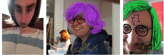
Figure 3. Images Produced by the Artists in Workshop 1.