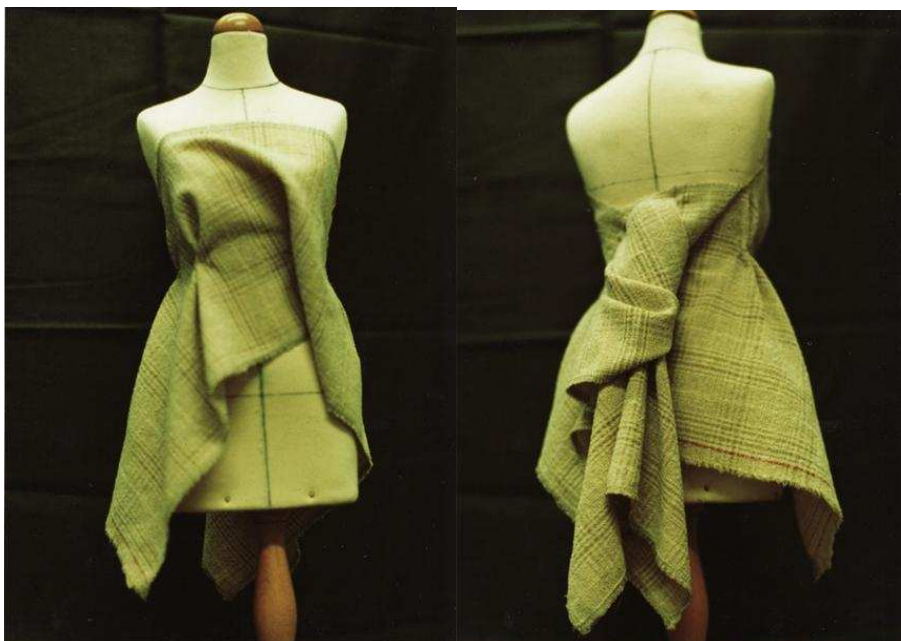
Figure 3: Sample of a SCT toile – experiment with one split