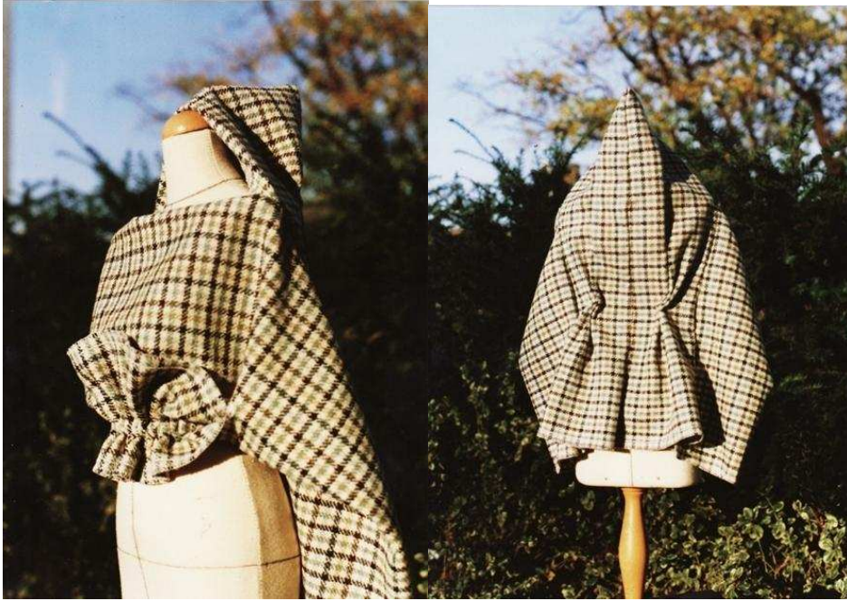
Figure 4: Sample of a SCT toile – experiment with two splits