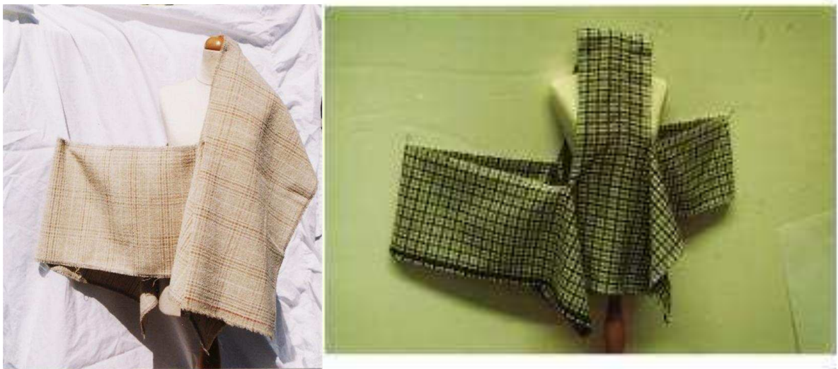
Figure 2: SCT cloths with one split (left) and two splits (right)

The Researcher then experimented with SCT in half- and full-scale and developed toiles see Figures 2-4 below as well as finished, wearable garments.