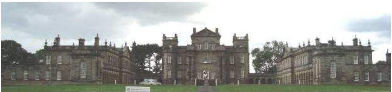
Figure 1: Seaton Delaval Hall, John Vanburgh

At Northumbria, it was felt that while the third year curriculum of the undergraduate course had been constructively aligned, thereby achieving excellent results, this structure had not yet been effectively implemented in the lower years. A restructuring of the second year delivery allowed the programme to be reconsidered in the light of third year best practice and staff members' educational research.