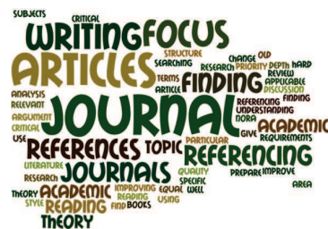
Figure 3. Wordle of responses to Stage 2 question: As a result of FFI what actions did you take in preparation for your semester 1 assignments?

A clearer distinction between feedback analysis and actions taken had been expected. For example, to the latter question some specific actions such as signing up for a class in information literacy, or consulting a specific grammar book were, perhaps naïvely on the part of the staff, expected. With reference to Gibbs and Simpson’s (2004:25) condition 9 – Feedback is received and attended to – we could conclude here that it had been received but whether it had been attended to, or acted upon could not be established. In other words, we could say that students appear to possess an understanding of the standard, but we