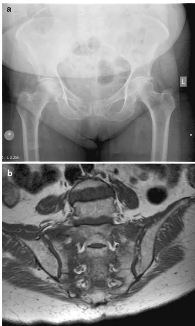
Fig. 1 a Anteroposterior radiograph of pelvis of an 84-year-old woman with back pain showing right superior and inferior pubic rami fractures. b Coronal T1-weighted magnetic resonance image scan of same patient showing sacral osteoporotic fracture