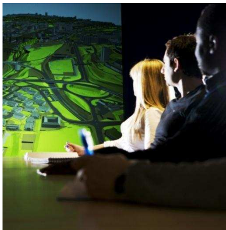
Figure 2 Sharing city model data in a collaborative environment

Northumbria University, School of the Built Environment has been developing a 3D model of NewcastleGateshead for the purposes of education and research, and has used this model to raise awareness of the benefits and potential of the technology to the city authorities of Newcastle and Gateshead, both currently challenged by significant levels of regeneration activity. The model currently covers an area of 8 sq km and original data was provided by UK data provider ZMapping. The university has optimized this data and uses software platforms AutoCAD, 3DS Max and VR4MAX for modeling different levels of detail and enabling interaction with the model. This model can be displayed to individuals or groups of people in the School's Virtual Environment facility. This facility supports interactive navigation, stereoscopic projection and is based upon PC hardware.