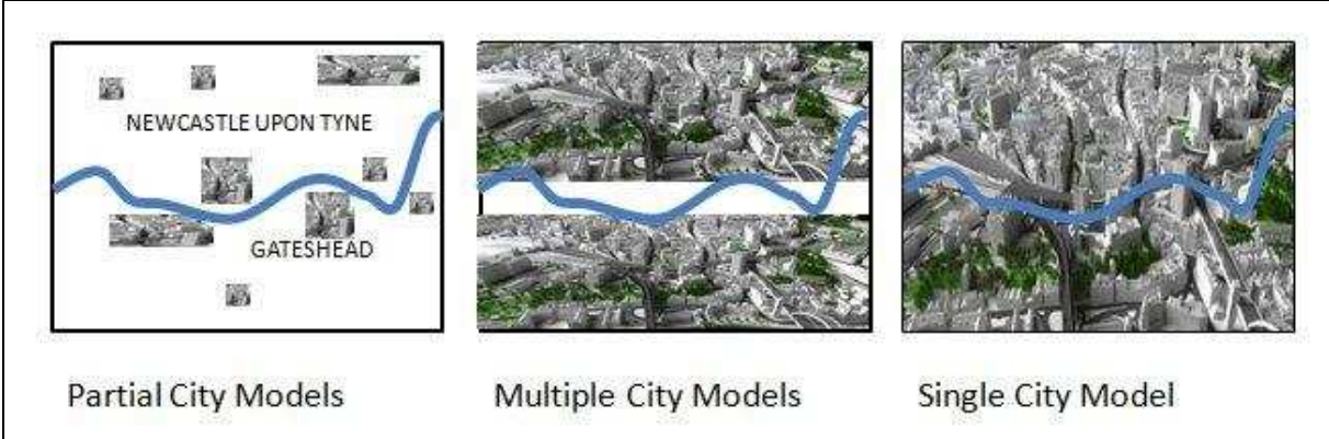
Figure 1 City Modelling Scenarios

There are many decisions that city authorities have to take when embarking on the creation of a city model. City models worldwide are offering examples of what is now possible to achieve with today’s technology, but the choice of options available, in terms of computer platforms, data capture, service providers etc can be daunting to those starting out in this field. Indeed, several cities around the world have now more than one city model, supporting the argument (Bourdakis 2008) that not one single type of 3D digital model can be suitable for the wide range of applications demanded from them. Even in cities without a city model to date, many parts of the city will have been modeled to support individual development proposals, or to market new projects etc, resulting in a jig-saw of 3D models using incompatible computer platforms and diverse scales (Figure 1). This has been the case with NewcastleGateshead in recent years, and is one of the economic drivers for the creation of one definitive, interactive model of both cities.