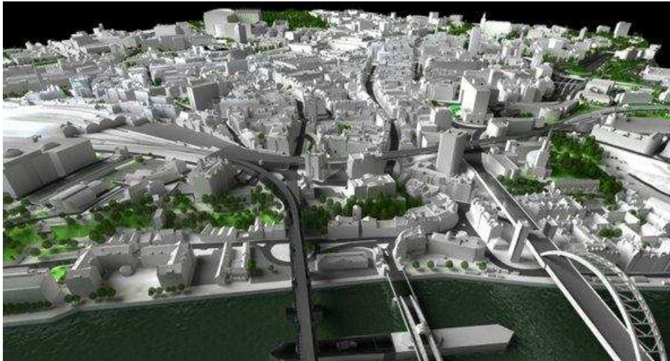
Figure 2 city model to date (Context model © Zmapping Ltd 2008)

models. However previous research (Whyte 2002) observed a lack of utilization of models that had been created by academia. An alternative collaborative relationship between academia, local authorities and other interested parties was suggested as a way forward for the creation and maintenance of city models (Horne et al, 2007). Northumbria University's School of the Built Environment has well established professional relationships with urban planners, developers and architects in the region. Recent activities have included the integration of Virtual Reality into the built environment academic curriculum (Horne and Thomson, 2008) and the creation of a city model for teaching, learning and research purposes (Figure 2). The university is in a position to now undertake a coordinating and collaborative role with all stakeholders to further develop and maintain a city model.