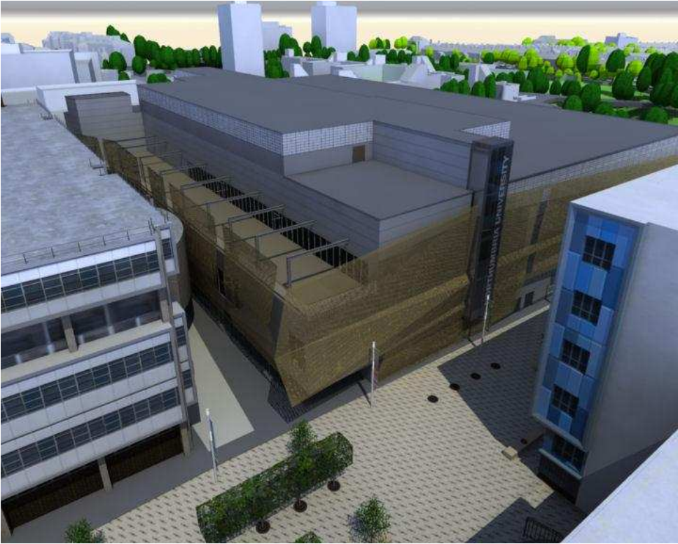
Figure 2 Several levels of detail within Virtual NewcastleGateshead

been identified as a key requirement by all participants.