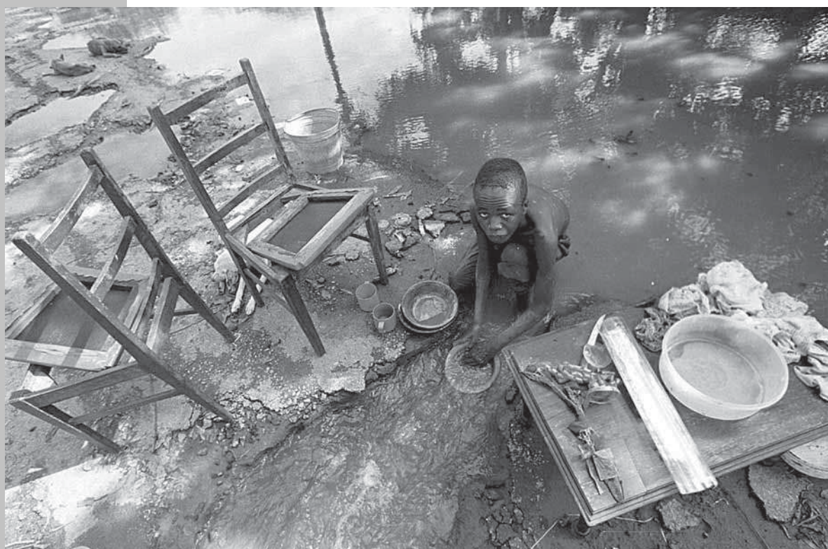
A boy washes dishes in the flooded waters of Chokwe, Mozambique, in 2000. Since then, the flood-prone country has made excellent progress in taking early action before a flood becomes a major disaster.

ment, and run by the Disaster and Development Centre (DDC) and ICDDR,B. This explores how secured health can have an impact on disaster mitigation, including through localized and community-based risk assessments. One of its findings in Bangladesh is that, when asking cyclone- and flood-affected communities about the greatest disaster threats they confront, they frequently refer to economic and social factors. This finding guided the programme into considering health security as an issue of social strengthening, rather than just in terms of resistance to environmental hazards. A further aspect of this approach is to examine how health enables early action in the face of prevalent and forthcoming risks. By implication, early warnings in these contexts are also about identifying the presence of a defence that is a strategy for health and for dealing with threats to everyday life.