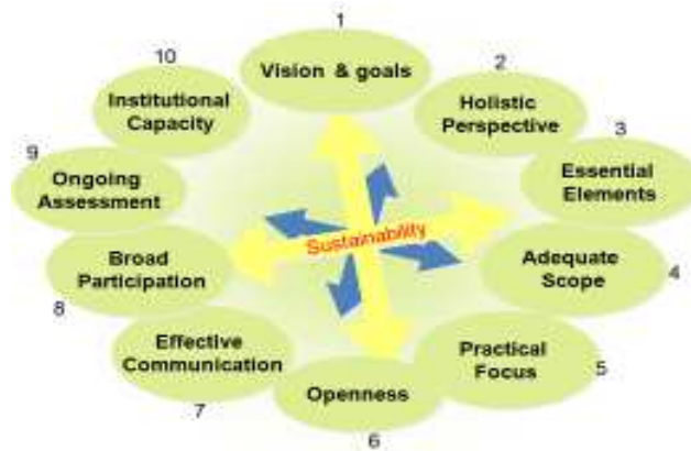
Figure 4 – The Bellagio Principles towards sustainability

In any case, the frameworks, the categories of data, the information and the choice of specific measures, reflect the values, biases, interests, and insights of the participant designers. In addition, value-driven principles are often developed as part of strategic planning exercises linked to such interests and various initiatives. The provision of insights and guidelines for attaining competitiveness and sustainability requirements, under variant product and market conditions, is critical for regional SMEs that produce high quality agricultural products, like the following case of Union of Agricultural Cooperatives, in the Messinia region, Greece.