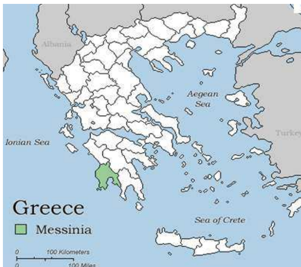
Map 1 - Messinia region , Greece

The Union of Agricultural Cooperatives (UAC) is located in Messinia region, Greece. Lying at the south-western most tip of the Peloponnese, Messinia covers an area of 2.991 square kilometres, has 210.000 residents and is administratively separated into 29 Municipalities and 2 communities (Map 1). It enjoys favourable climate conditions, in combined temperature, humidity, etc. for producing high quality farm products for health and special flavour, and recognition by the EU as PDOs for these reasons. The capital of the region is Kalamata, the most important harbour of the Peloponnese after Patras.