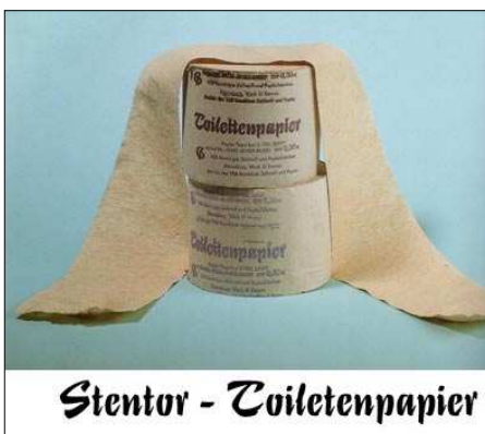
Stentor - Toilettenpapier