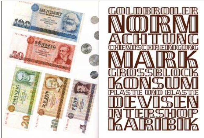
Sektor typeface by Sylvia Janssen - derived from East German banknotes