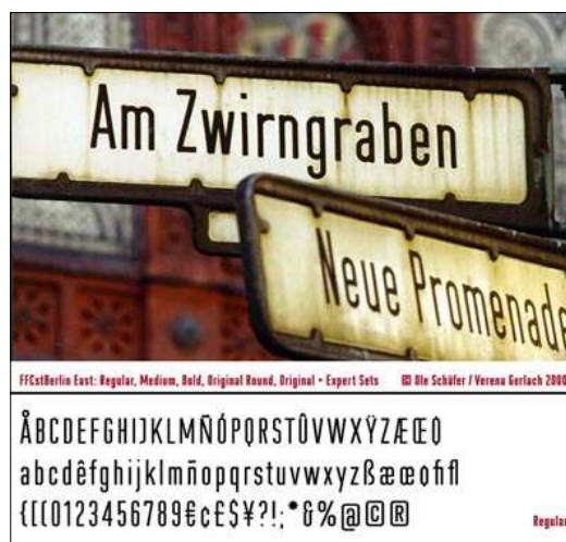
FF City Street Type (2000) Ole Schäfer & Verena Gerlach

Other designs have come from more unusual sources. The humble East German banknote inspired Sylvia Janssen to design Sektor as part of a series of banknote-style fonts relating to themes of consumption. FF City Street Type (2000) by Ole Schäfer and Verena Gerlach is a family of fonts based upon the distinctive (and now almost forgotten) street signage systems of West and East Berlin. Schäfer and Gerlach had a huge respect for the typographic standards of the Eastern designers and were inspired by signs bought in a fleamarket.