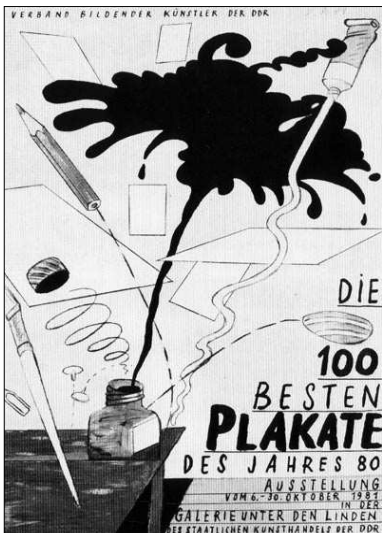
Volker Pfüller (1981)

Volker Pfüller and Helmut Brade have very expressive and calligraphic approaches to typography in their theatre and exhibition posters. Hand drawn typography and image become linked into a coherent artistic statement. Idiosyncrasy and the unique character of personal handwriting stand in opposition to the homogenous collective. Brade found that alternatives to letterpress type, like Letraset, were simply too expensive.