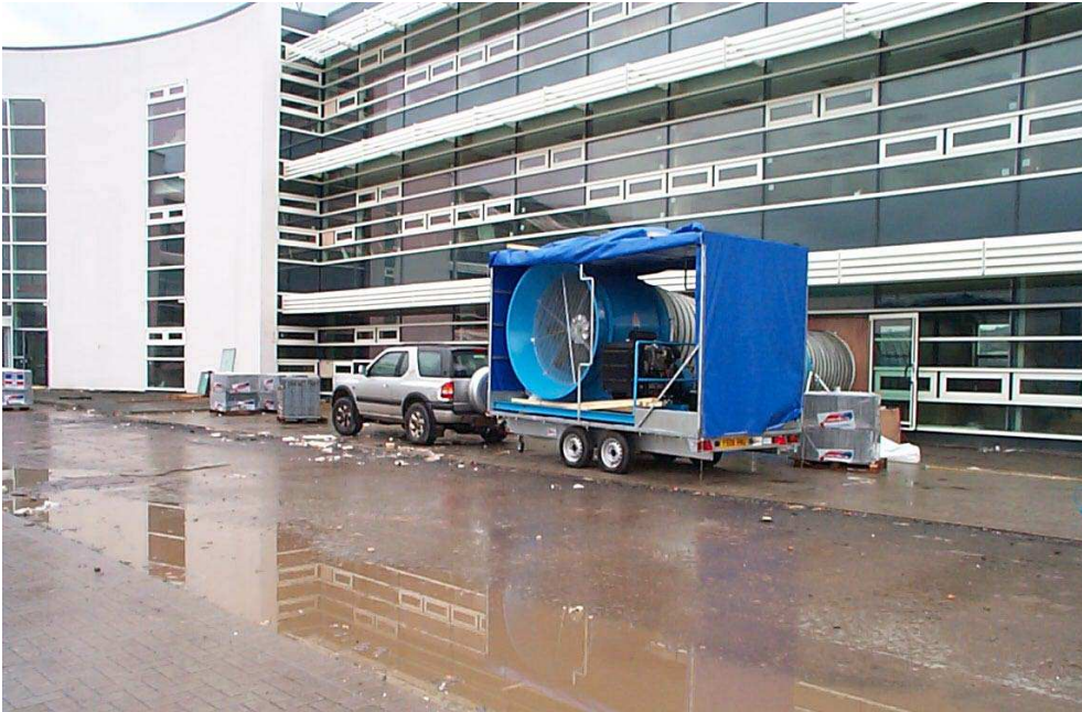
Figure 1. Air Leakage Testing at Riverside House, January 2003.

With the requirement set, the Design Team held a workshop with Tolent on site to agree a strategy for detailing, construction and testing. Tolent took the sensible step of undertaking an air leakage pre-test when the building was substantially airtight, although it was known that there was still an amount of sealing to complete. Air Tightness Services from Leeds completed this pre-test in October 2002 and it demonstrated an air permeability of 14.6m 3 /h/m 2 at 50Pa. Testing with smoke pencils clearly indicated the leakage paths to Tolent and this information was fed through to the site team for remedial action where required.