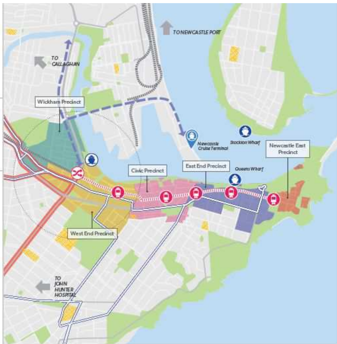
Figure 2 – Polycentric linear ‘Precinct’ approach to Newcastle city centre renewal (Greater Newcastle Metropolitan Plan 2036)