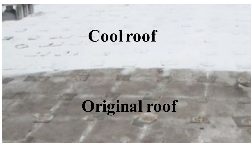
Figure 1. Experimental roof of a residential building in Singapore.

other properties (thermal and solar radiation) of the building materials and climate inputs could be referred from [16].