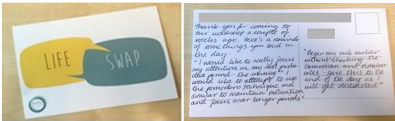
Fig. 3 Post-cards sent to participants 2 weeks after the study

Each of the 18 participants took part in two conversations, resulting in a total of 18 conversations (2 people per conversation, 2 conversations per person) across the three workshops, all of which were transcribed. Coding of conversation transcripts was then conducted using both inductive and deductive techniques for thematic analysis. Initial codes around