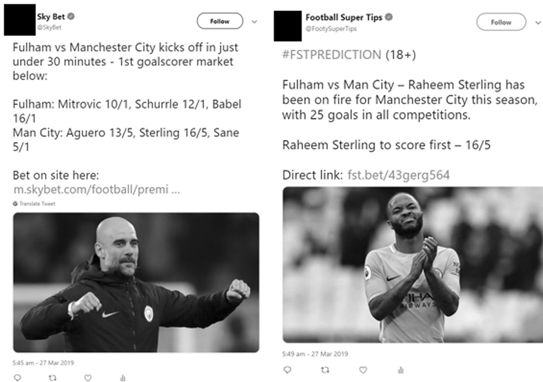
Fig. 1. Example of the difference in presentation between how bets were presented on an operator and an affiliate account

for 21 of remaining 100 participants were replaced via imputing the median values for each individual question across respondents. Mean values were then calculated for participants' five responses on each DV within each combination of account type and bet complexity. Pearson's correlations were conducted to assess the relationship between the three DVs at each combination of bet complexity and account type. Whilst all three DVs were significantly correlated for medium and high complexity bets ( P < 0.05 ), bet spend was not significantly related to either likelihood to bet or bet confidence for low complexity bets ( P > 0.05 ), justifying the inclusion of the three separate DVs. Assumptions of a two-way repeated measures ANCOVA were then considered for each DV. Data for bet spend was highly skewed and therefore a log transformation was applied. Where data did not meet the assumption of sphericity, a more conservative test of within-subjects effects was considered. Whilst there were some outliers within the data, analysis was run with and without the outliers. It was found that the outliers did not alter the main findings and were considered possible responses, therefore remained within the analysis.