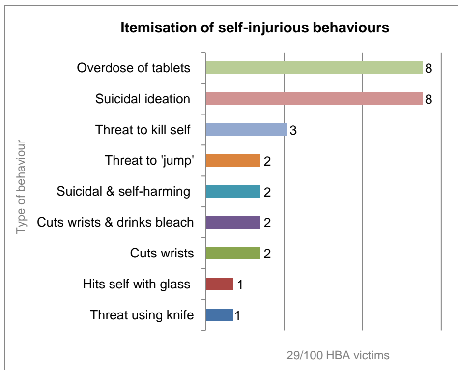
Chart 1.2: Itemisation of self-injurious behaviours

The key spike of self-injuring HBA victims were aged 18-22 years in this sample, with the average age of victims established at 22.6 years. This research correlates entirely with Chesler's worldwide study of 230 honour killings (2010) and also Chesler and Bloom's findings (2012) regarding the highest risk age, which averages at 22.5 years vi . These risk periods dovetail with the depression and self-injury findings, in which 74% (29/39) of those victims suffering depression, were aged 24 years or under, including children (10/39), with severe cases of self-injury aged between 18 and 24 years (6/9). Findings showed 29% (29/100) of victims self-injured, had suicidal ideation and/or attempted suicide, of which overdosing was the most prominent method. Three of the eight overdose victims were children (case 26, 45 and 93). Of this subset, 62% (18/29) originated from Pakistan, 14% (4/29) from Bangladesh, followed by India (10%) (3/29), Kurdistan (7%) (2/29) and Libya (7%) (2/29). Only one of the self-harming victims was male. Of the 29 cases, 27.5% (8/29) were children. One child attempted to jump from a first-floor window because her father discovered she owned a mobile phone (case 62).