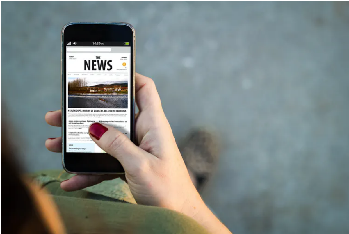
The news is part of our daily lives.