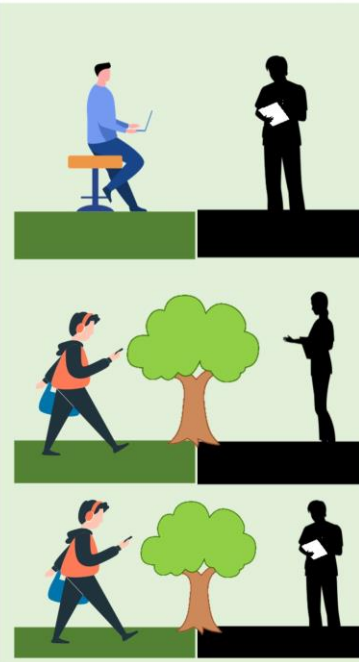
b. Digital Assessment Techniques