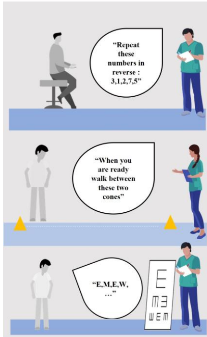
a. Traditional Assessment Techniques