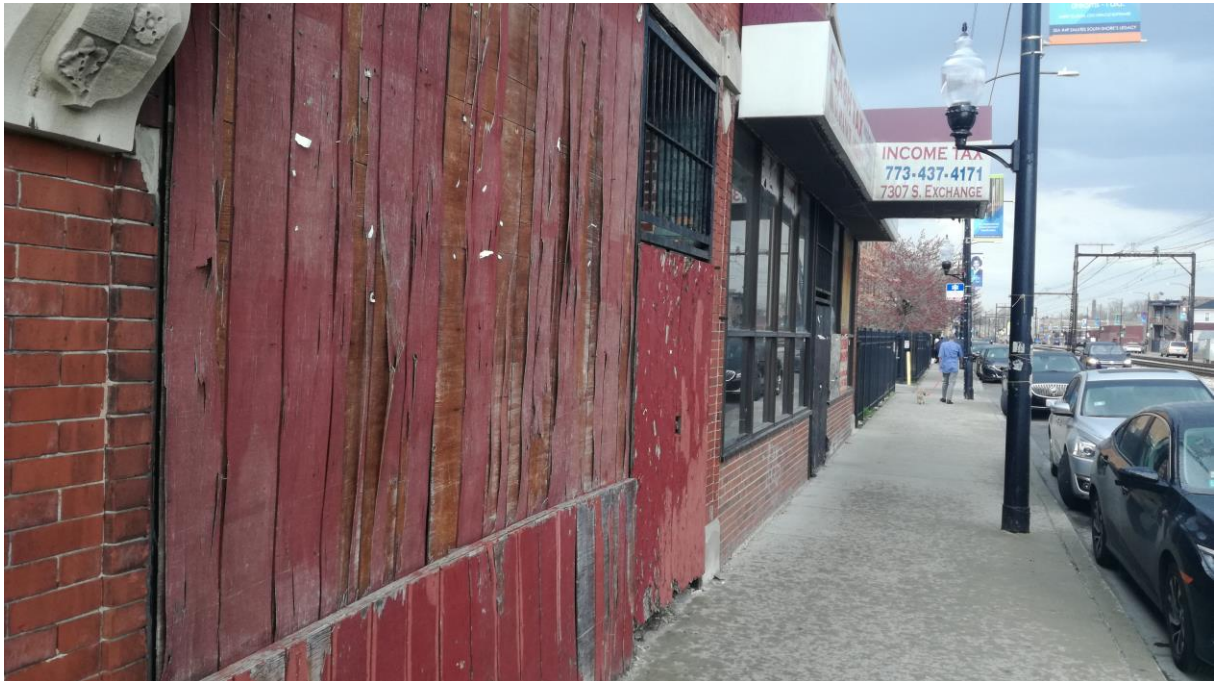
Figure 1: Vacant store on 71st street, South Shore (Authors' photograph, 03 May 2018)

characterize them, only interrupted by several liquor stores, hairdressers, and occasionally, a café or restaurant (see figure 1).