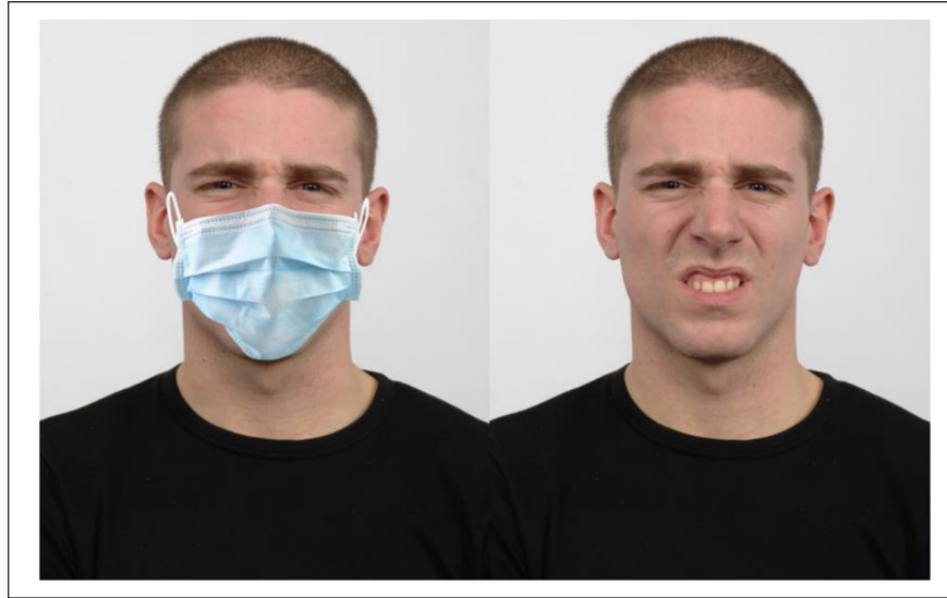
Figure 1. Example stimuli (left masked, right unmasked), with both images of a model presenting the emotion of disgust.

Smithson, 2020). Langner et al.'s (2010) study also validated the facial stimuli to ensure that facial expressions of emotion were of average intensity. As part of Langner's validation study of the Radboud Database, participants were asked to rate each face, on a five-point Likert-type scale ranging from weak to strong, regarding the intensity at which each emotion was facially expressed. As emotions tend to be facially expressed with average intensity within typical everyday interactions (Motley & Camden, 1988), this study utilised face stimuli where emotions were deemed to be expressed with average intensity as validated by Langner et al. This study also utilised 12 models to present emotions acceptably within one standard deviation of the intensity judgements from all 57 models, while also having a high emotion agreement, in accordance with Langner's validation of the Radboud Faces Database. See Figure 1 for an example of a model expressing disgust both with and without a mask overlay.