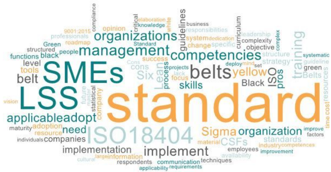
Figure 2. Word cloud